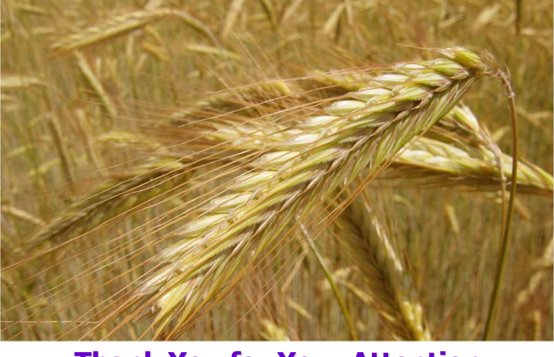
Thank You for Your Attention